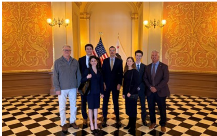
ASHRAE Government Outreach Day volunteers in the California State Capitol

On April 27, a team of volunteers from ASHRAE's California chapters met with lawmakers at the state capital. The team introduced state senators and assemblymembers to ASHRAE, shared the society's public policy priorities, and advocated for the continuation of the California Schools Healty Air, Plumbing, and Efficiency Program (CalSHAPE). The program began in 2020 to fund indoor environmental quality (IEQ) assessments and subsequent improvement projects in the state's public schools. CalSHAPE sunsets at the end of this calendar year, and any unspent money in the program's coffers will be clawed back by the investor-owned utilities that funded the program. ASHRAE volunteers met with energy and budget lawmakers and staff to explain the benefits of IEQ, ASHRAE's role in IEQ, and to educate lawmakers on the CalSHAPE program. If you are an ASHRAE member interested in meeting with your elected officials on behalf of the society, please reach out to Government Affairs staff at govaffairs@ashrae.org .